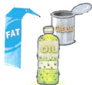
FATS, OILS & GREASE