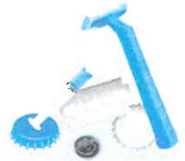
METALS & PLASTICS