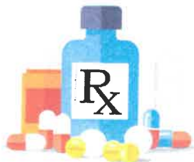
MEDICATIONS & SUPPLEMENTS